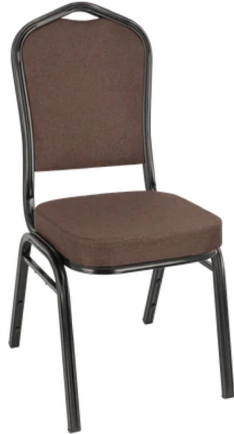
Premium Banquet Stacking Chair Grey £20.00 GBP